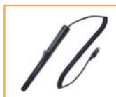
HUMIDITY PROBE P/N: VZ872PAZ FOR #8721/8723 Size: 14dia x216mm(l)