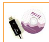
USB CABLE & SOFTWARE P/N: VZUSBAZM